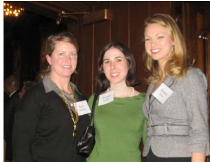
Volunteering at the Kids Count Symposium

Just search Facebook for “Voices for Illinois Children Associates Board.”