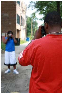
Kids from the Excellence Academy taking photos in Chicago's Englewood community with Voices for Service volunteers.

During the third quarter, Associates Board members contributed their time, talents and resources to exciting projects and events.